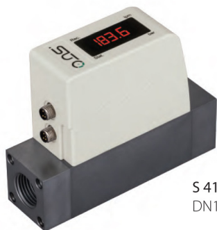
S 415 as DN8 or DN15 version