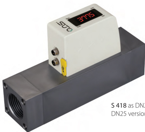
S 418 as DN20 or DN25 version